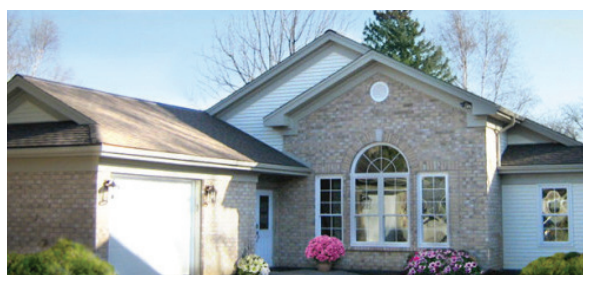
Contact us for your tour today.